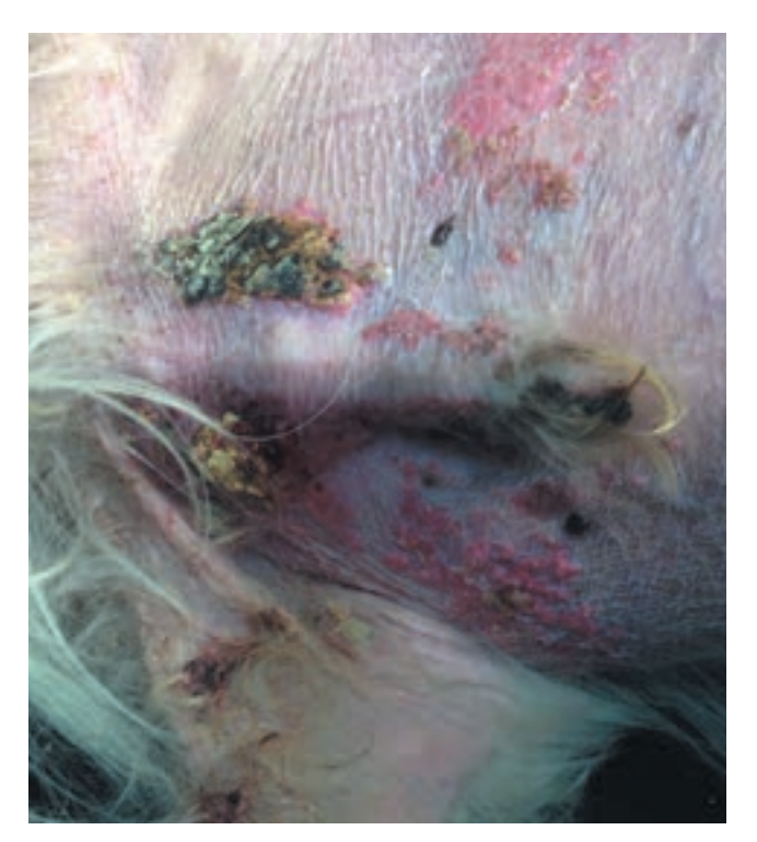
Figure 5: Thin skin, prominent subcutaneous blood vessels, calcinosis cutis and "rat tail" in a 16-year-old male neutered Maltese with PDH.

It should be emphasised that there are different specialist opinions about the best test to use in dogs with suspected HAC. Furthermore, reference ranges and cut-off values