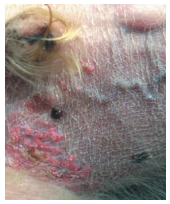
Figure 6: Simplified scheme of the HPPA in dogs with HAC due to a functional adrenal tumor (FAT).

kg IV) can be used to effectively monitor treatment of PDH with trilostane or mitotane, however is not recommended for diagnosing HAC.<sup>11</sup> Similarly, accidental perivascular, instead of IV injection of ACTH, does not affect results.<sup>12</sup> A depot ACTH preparation can be used at a dose of 5ug/ kg IM; however, should not be given intravenously. Blood samples for determination of cortisol should be taken immediately before and three hours after depot ACTH administration to diagnose HAC.<sup>13</sup>