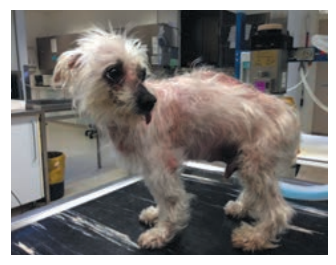
Figure 4: Muscle wasting, distended abdomen and diffuse alopecia in a 16-year-old male neutered Maltese with PDH.

microadenomas at time of diagnosis is unknown. HAC due to FAT is caused by adrenocortical adenomas and adenocarcinomas that secrete excessive amounts of cortisol autonomously, and independently of pituitary control. Hypercortisolaemia suppresses hypothalamic CRH and circulating plasma ACTH concentrations. The result of this chronic negative feedback is cortical atrophy of the unaffected adrenal gland and of non-neoplastic cells in the affected adrenal gland (Figure 3). It is difficult to distinguish between adenomas and carcinomas even on histopathology. Features of malignancy are adrenal tumors >2cm and vascular invasion. Calcification is not a feature of malignancy. Malignancy is confirmed if distant metastasis appears similar on histopathology.