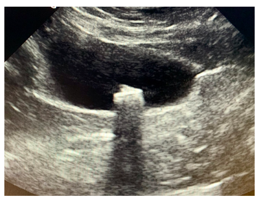
Figure 1: Diagnostic imaging can be beneficial in diagnosing concurrent conditions, such as uroliths.

In practice, CKD is generally diagnosed on the presence of: an increased serum creatinine concentration (>140 \mu mol/l) and evidence that clinical findings have been present for a significant length of time (>3 months). There are some