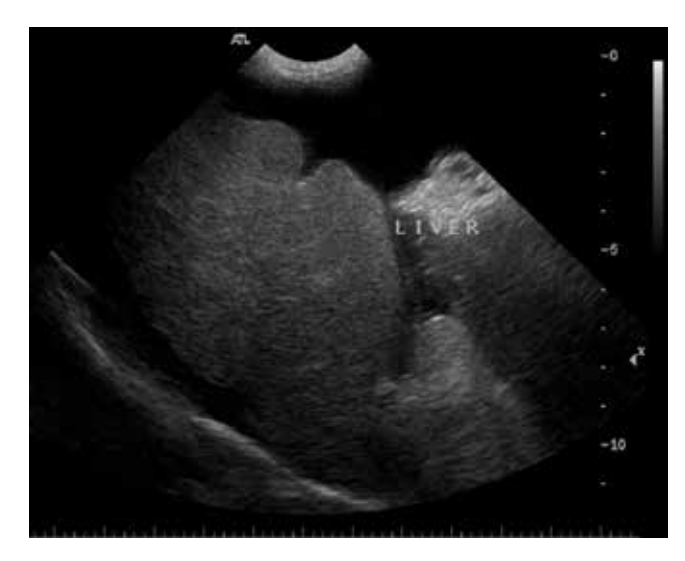
Figure 2: Ascites associated with CH are usually due to portal hypertension, however hypoalbuminaemia may also contribute to its pathogenesis.

Elevations in serum bile acids are usually evident, and occasionally hyperglobulinaemia is found. Haematological changes can include anaemia of chronic disease, microcytosis, leucocytosis and sometimes thrombocytopenia (Willard, 2010). Urinalysis of dogs with CH may demonstrate a low urine specific gravity (<1.030), bilirubinuria, increased urobilinogen, urate crystals or calculi (Bexfield, in press). Diagnostic imaging is often performed to investigate patients with CH, and as with AH ultrasonography is the preferred imaging modality. Ultrasonographic examination, however, is often non-specific, but microhepatica, ascites and nodularity of the liver may be found (Willard, 2010). Radiographs of the abdomen may or may not demonstrate alterations in liver size or the presence of ascites. Definitive diagnosis can only be achieved from histological examination of liver tissue. Again, fine needle aspiration is not reliable for the diagnosis of CH, and is not recommended. After a liver biopsy is performed, all animals should be monitored for signs of bleeding for at least 12