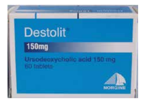
Figure 2: Ursodeoxycholic acid (UDCA) displaces toxic bile acids, stimulates bile flow (it is a choleretic), is immune modulating and encourages antioxidant activity. Although uncommon, it should be avoided in dogs with complete biliary obstruction.

Ursodeoxycholic acid (UDCA) is a natural hydrophilic bile acid in enterohepatic circulation, which canalso be manufactured into tablet or capsule forms (Rothuizen, 2010). UDCA is used widely in both human and veterinary medicine with no significant adverse effects reported to date. UDCA displaces toxic bile acids, stimulates bile flow (it is a choleretic), is immune modulating and encourages antioxidant activity (Rothuizen, 2010). Its antioxidant activity has reportedly