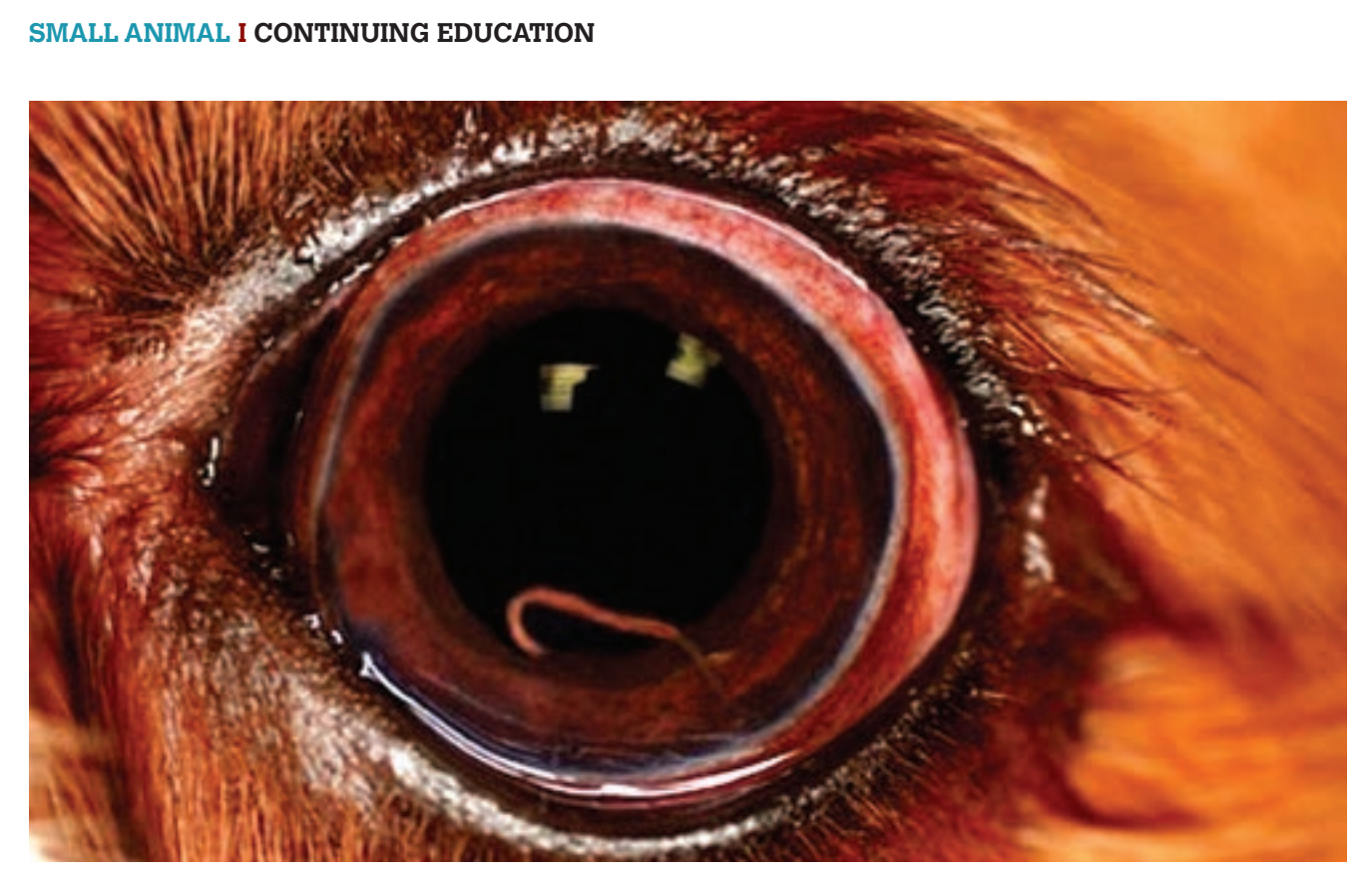
Figure 2: An example of ocular angiostrongylosis.

finding was later supported when five dogs out of a group of eight naturally-infected dogs had a murmur whose maximum intensity was detected overlying the tricuspid valve (Novo Matos et al, 2016). However, these dogs had to be classified as severely infected before being included in this study, thus the findings may not be apparent in dogs presented at firstopinion practice with a milder infection. Treatment for the clinical signs associated with pulmonary hypertension and cardiac failure includes the use of arteriodilators, angiotensin converting enzyme (ACE) inhibitors and diuretics (Maltman et al, 2013; Nicolle et al, 2006; Brennan et al, 2004). A case of persistent syncopal episodes was successfully treated with the bronchodilator theophylline, however, further research is needed to prove whether this treatment is the most effective (Brennan et al, 2004). The treatment of these clinical signs must take place in conjunction with anthelmintic treatment of the underlying infection. The reversibility of these cardiopulmonary signs has been suggested to be based upon the severity of infection (Koch and Willesen, 2009).