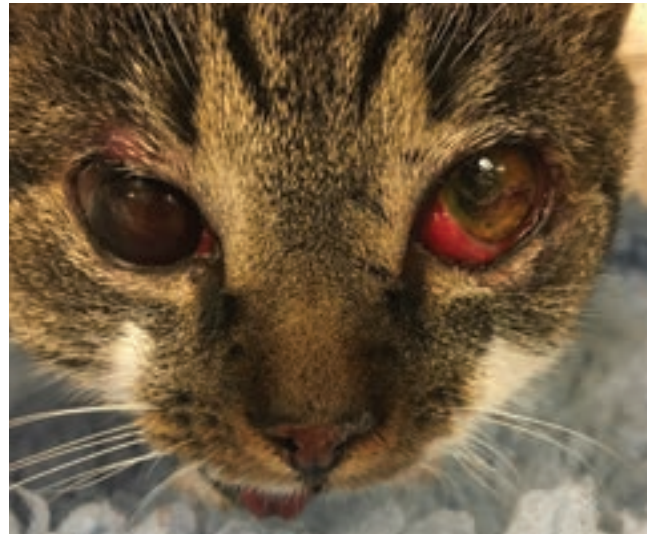
Figure 4: Cat with mandibular fractures and hyphaema in the right eye. Also note superficial corneal erosion, likely due to opioids suppressing blinking.

Placement of an oesophagostomy tube should be discussed, especially if performing anaesthesia for other reasons. Ocular injuries can range from mild globe protrusion to complete proptosis. The prognosis for vision is often not known at presentation but the presence of hyphaema is often associated with a poor prognosis (Figure 4). Globe ruptures tend to occur posteriorly and so may not be evident on physical examination (see Figures 5 and 6).