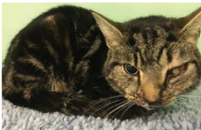
Figure 7: Cat with traumatic uveitis.