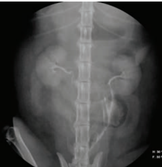
Figure 12: Fluoroscopic contrast study confirming ureteric rupture.