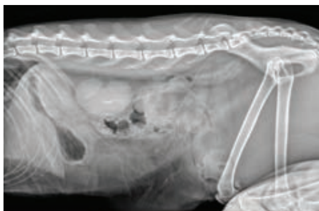
Figure 10: Lateral radiograph of a cat with ventral abdominal rupture with gastrointestinal contents.