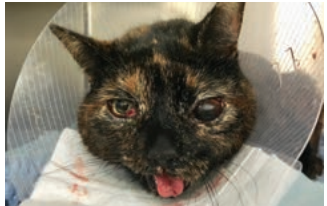
Figure 5: Cat with jaw fractures and lagophthalmic eye that was later confirmed to be ruptured.