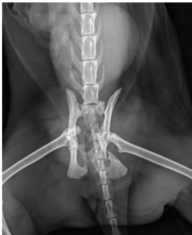
Figure 9: Survey radiograph of a cat with coxofemoral luxation, sacroiliac luxation, pubic symphysis fracture and ischial fracture.

in ambulatory cats (Figure 9). Crepitus on manipulation of the pelvic limbs or palpation of fractures directly via rectal examination can provide an initial indication. Sacroiliac, coxofemoral and distal joint luxations, as well as long bone fractures are also fairly common and may be evident on physical examination or can be assessed on survey radiographs. The abdomen should also be carefully palpated for subtler abdominal wall ruptures (Figure 10).