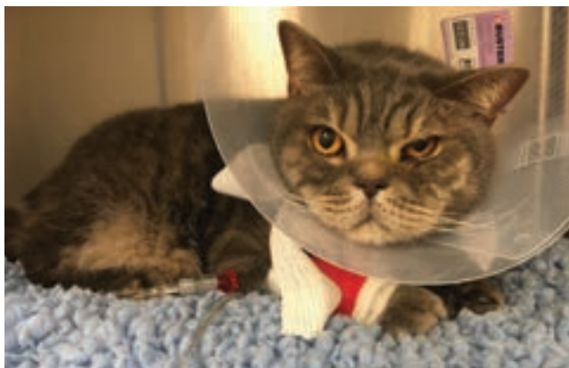
Figure 8: Cat with Horner's syndrome secondary to a brachial plexus injury.

Where trauma or opioid medications mean blinking is reduced or not possible, frequent lubrication (eg. Celluvisc ™ every two to four hours) should be used prophylactically to reduce the risk of corneal ulceration. Temporary procedures, for example a tarsorhaphy (Figure 6) may be required to protect the corneal surface and provide compression of retrobulbar swelling while pending any resolution of vision. A non-visual, traumatised eye should ideally be enucleated, as there is a link to primary ocular sarcomas in cats with a history of globe trauma (Zeiss et al 2003).