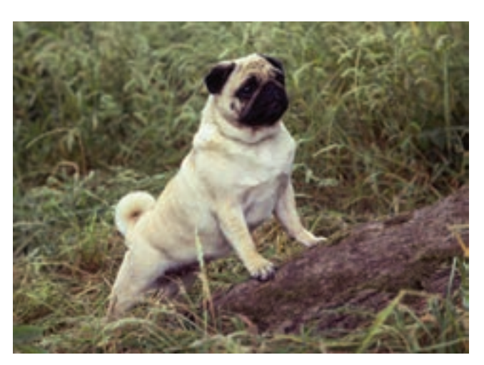
Figure 1: Pug.

Ownership of Pugs in England is rising steeply. Higher levels of overweight/obesity and corneal disorders compared with other breeds suggests that these conditions are health priorities for the breed and provides an evidence-base for reforms to improve health and welfare within the breed.