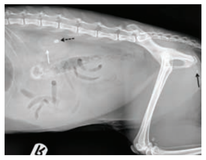
Figure 2: Right lateral survey abdominal radiograph of a cat. There is reduced serosal detail, consistent with peritoneal effusion. A nephrolith is superimposed over the left kidney/left ureter (dotted black arrow). Small nephroliths/ calcifications are superimposed over the more cranially located right kidney (white arrow). There is also a urethrolith present in the distal urethra (black arrow).

Occasionally, free gas may also be present within the abdominal cavity. This is more commonly associated with distal urinary tract rupture, at the level of the urethra. The survey radiographs may also reveal the presence of uroliths within the urinary tract (see Figure 2).