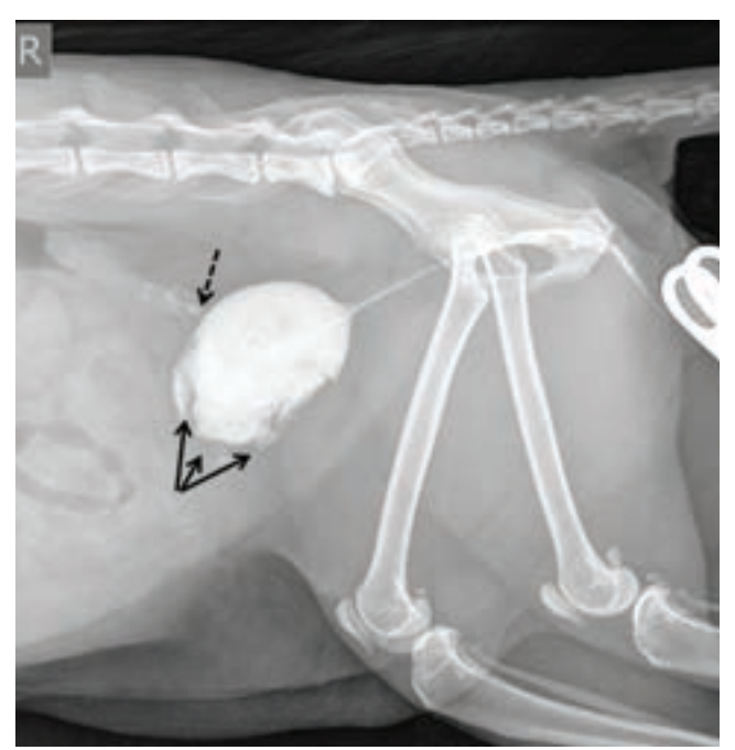
Figure 3: Retrograde positive contrast urethrocystogram – right lateral radiograph of the caudal abdomen of a cat. The cranial wall of the urinary bladder appears thickened with multiple heterogeneous filling defects, indicating severe bladder wall thickening (black arrows). There is loss of serosal detail within the abdomen, consistent with peritoneal effusion. A ruptured bladder is confirmed by the single jet of contrast leakage present on the dorsal aspect of the bladder at the level of L6 (dashed black arrow).

Positive-contrast radiography is subsequently used to identify the exact site of urine leakage. To aid interpretation of the urogenital tract it is advisable to perform an enema to evacuate the colon. A retrourethrocystogram (see Figure 3) is useful for highlighting leaks within the lower urinary tract (urethra, urinary bladder) and is often the method of choice in the majority of clinical settings. On the other hand, intravenous urography will allow identification of a