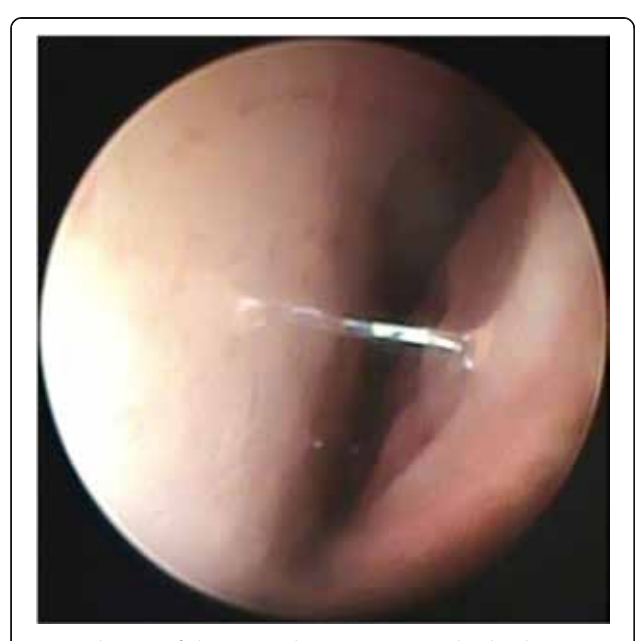
Fig. 2 Absence of changes in the same German Shepherd (2A, Group 2, Table 4, After treatment, Endoscopic changes) after combination therapy assigned as –, as no endoscopic changes in total endoscopic system

Table 6, Wilcoxon's analysis). The significant differences (p < 0.05) were found between experimental (1, 2, 3) and the control (4) groups. The dogs showed a statistically significant reduction in characteristics of LPR before and after treatment, as measured by clinical signs (see