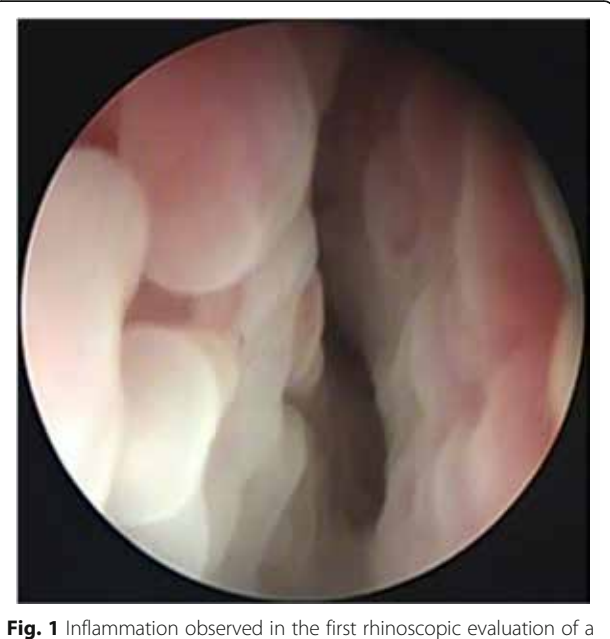
Fig. 1 Inflammation observed in the first rhinoscopic evaluation of a 7-year-old German Shepherd (2A, Group 2, Table 4, Before treatment, Endoscopic changes) subjected to combination therapy; assigned as +++ as severe endoscopic changes in total endoscopic scoring system (Table 2)

Table 6, Wilcoxon's analysis). The significant differences (p < 0.05) were found between experimental (1, 2, 3) and the control (4) groups. The dogs showed a statistically significant reduction in characteristics of LPR before and after treatment, as measured by clinical signs (see