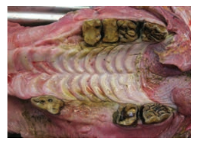
Figure 1: A geriatric cadaver skull showing multiple missing teeth.

With geriatric animals requiring dental treatment, it is important to take a full medical history and examine the animal as a whole to rule out concurrent disease. Particular abnormalities, such as large non-healing cheek and tongue ulcers, may suggest underlying disease such as pituitary dysfunction. Cardiac disease and orthopaedic problems, such as arthritis and muscle weakness need to be considered when sedating and restraining geriatric animals for dental examination. These animals tend to have increased sensitivity and decreased clearance of the