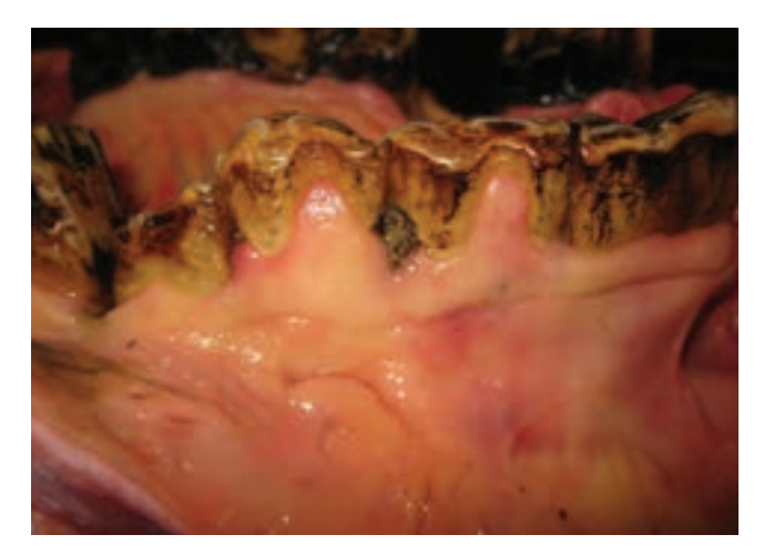
Figure 5: Photograph of a geriatric cadaver skull showing extensive wave-mouth formation.

Treatment of cheek-teeth disorders in geriatric animals is often limited due to the lack of reserve crown. As much of the occlusal crown should be preserved to allow efficient