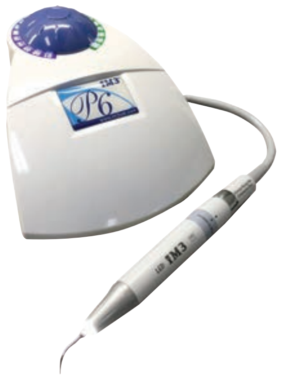
Figure 3: Mechanical scaler.

Most common scalers remove plaque and tartar from the tooth surface by means of mechanical action. Never use the very tip of these scalers as they will damage the tooth's enamel surface. The tip also generates heat so keep moving it horizontally across the tooth surface and never work on a single tooth for more than a few seconds. Use enough coolant water to prevent thermal injury to the vital pulp structure.