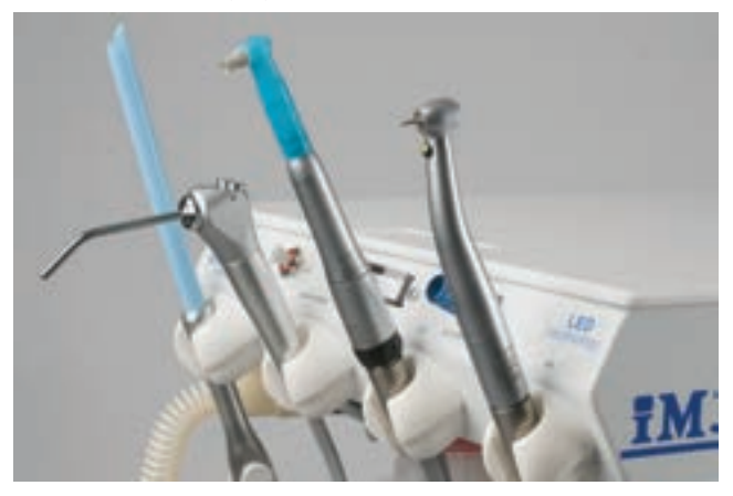
Figure 2: Dental unit.

A dental unit with a pressurised air/water delivery system to a high- and low-speed handpiece, three-way syringe and a mechanical scaler should be the staple of every veterinary practice. The low-speed feature is used for polishing and advanced surgical work. The high-speed handpiece, on the other hand, enables efficient sectioning through the hard tooth structure. The high-speed should have coolant water to keep the bur cool and lubricated and prevent thermal injury to the patient.