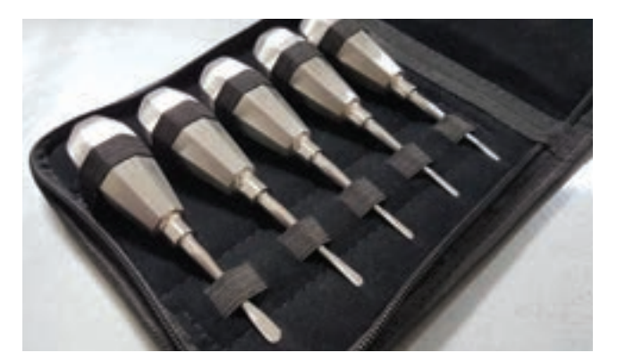
Figure 5: Luxators.

Both Luxators and elevators should fit comfortably in your hand. The handle should rest within the palm and your index finger reach the tip of the shaft for control. Too large a handle and it puts strain on muscles and tendons and too long a shaft and you lose control of the instrument.