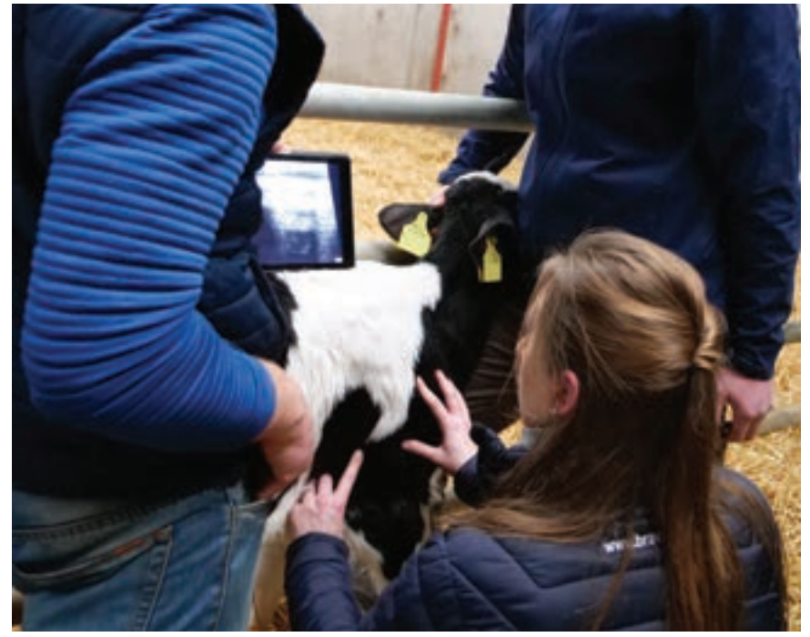
Figure 3: Demonstrating thoracic ultrasound technique.

A US study of weaned Holstein heifer calves that were scanned at 60 days old demonstrated that those calves with