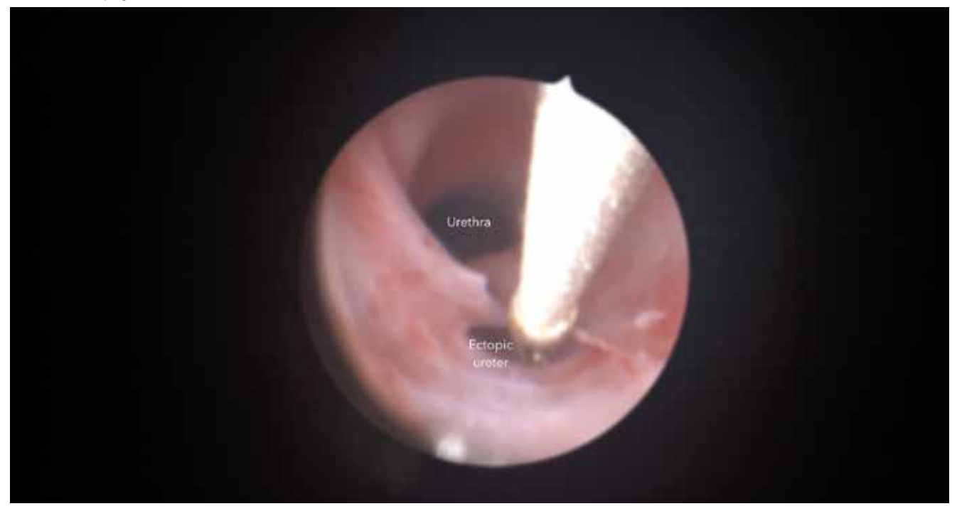
Figure 3. Transection of the EU wall under cystoscopic visualisation.

into the urinary bladder trigone. For unilateral EUs, the contralateral normal ureteral papilla can be used as a landmark.<sup>5</sup> The equipment must always be under direct endoscopic visualisation and targeted ventrally, to avoid inadvertent perforation of the lateral ureteral wall and subsequent uroabdomen.<sup>3,5,10</sup> Fluoroscopy may be used intraoperatively to characterise the EU conformation and assess the correct location of the newly-formed ureteral orifice within the bladder, reducing the risk of urethral tears.<sup>2,10</sup> Proposed advantages of cystoscopic-guided surgery include its minimally-invasive nature, which allows shorter hospitalisation times and quicker recoveries, and the ability to perform diagnosis and treatment under the same anaesthetic period, as previously mentioned.<sup>2,10</sup> These minimally-invasive techniques are also associated with fewer complications (both minor, such as dysuria and haematuria; and major, like uroabdomen) and with a lower incidence of incontinence recurrence after EU correction compared to open procedures.2,4