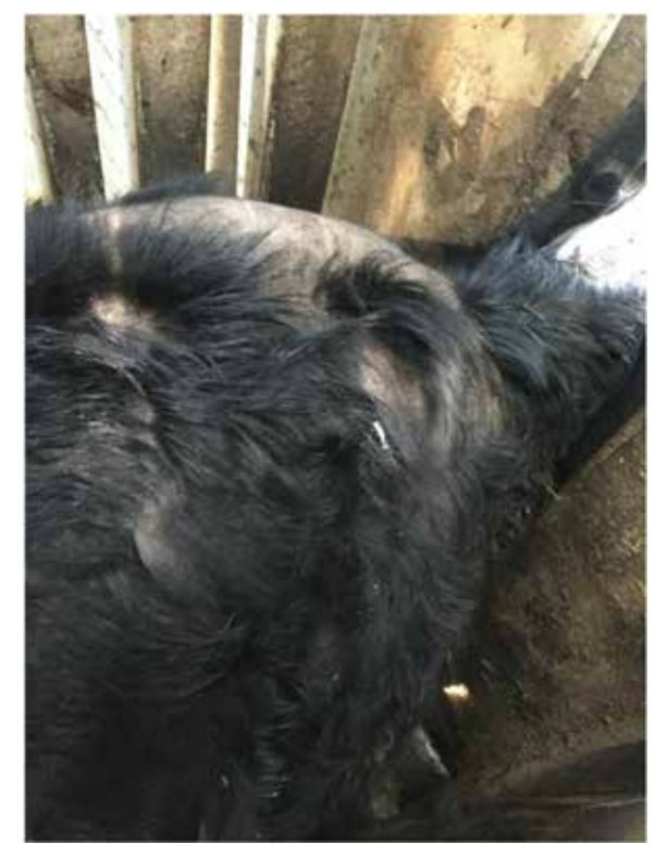
Fig. 1 A dorsal view of the shoulders of a heifer showing the coat damage caused by a heavy infestation of Bovicola bovis lice

Control of bovine pediculosis in Ireland, as in Europe, relies primarily on the use of commercial ectoparasiticides belonging to either the synthetic pyrethroid or macrocyclic lactone chemical classes. In recent years, concerns have been raised globally over the development of insecticide resistance in louse populations of livestock associated with the widespread use of ectoparasiticides in agricultural production. To date, resistance has been reported in a number of species of lice including Bovicola ovis , Bovicola ocellatus , Haematopinus tuberculatus and Haematopinus suis [16–19]. In 2015, Sands and colleagues published the first reports of deltamethrin tolerance in the cattle louse Bovicola bovis in the UK [20].