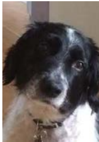
Figure 2: Mild head tilt seven weeks post-vestibular episode.

Once a dog is admitted, a full physical examination, followed by a neurological examination, must be carried out. An otoscope exam to assess for ear disease, and possible radiographs of the skull to assess the tympanic membrane of the middle ears should also be advised. Swabs for culture may be taken to rule out infection. Diagnosis is based on a complete history from the owner in conjunction with findings from the various exams carried out. Further diagnostics tests like computed tomography (CT) and magnetic resonance imaging (MRI), may be used to rule out any abnormalities like neoplasia.