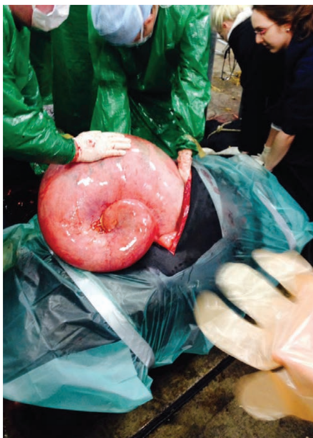
Figure 4: Exteriorisation of the uterus.