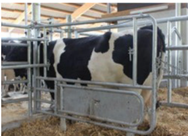
Figure 1: Different variations of calving gates and crushes available.

If the cow is agreeable, many can be managed standing with assistance holding the tail upright if they are loose haltered to a fixed point in a shed. However, even in quiet cows, swaying over and back can be a nuisance and unsafe. Sedation (as outlined below) can be useful in these cases. If possible, single or double-haltering cows halfway up a crush or a race and placing a fixed bar in front of them to stop them surging forward can restrain, stop side-to-side movement and give good access to the surgical site. Sometimes, placing a loose rope on the right hind limb in cows that have the potential of going down can facilitate pulling this limb from under the cow to keep the incision site off the ground. From a personal safety point of view, avoid doing caesareans where the gates or posts that are being used to restrain are poorly fixed; where there is risk of getting pinned between a wall/gate; and where a quick escape is not possible if the cow breaks loose from her restraints. Recumbent sedation with rope restraint is often the only safe method of operating on wild cows where facilities are lacking. Nevertheless, always be careful as sedation can be unreliable and ropes can break so ensure when possible you are not in a kick-zone and can escape easily.