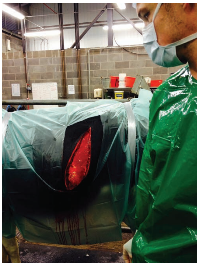
Figure 3: Low/left oblique flank approach.